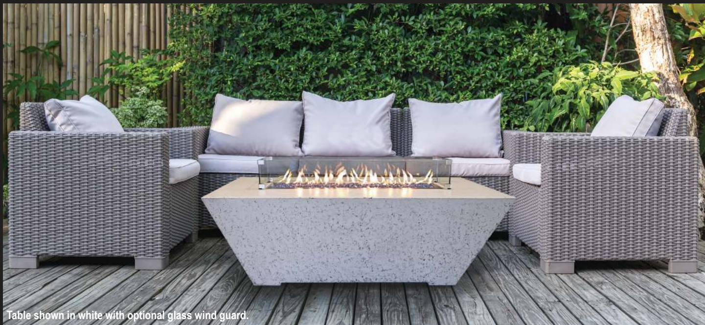
Table shown in white with optional glass wind guard.